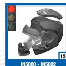
IN5080 - IN5082

FIND MORE MODELS CODE ON NEXT PAGE RETROUVER LES AUTRES REFERENCES DE MODELE EN PAGE SUIVANTE